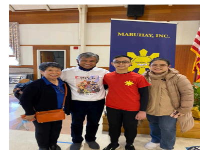
Usapan at Merienda with General Taguba