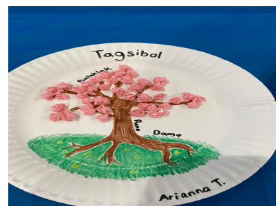
Tagsibol Arts and Craft