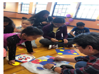
More fun arts and craft